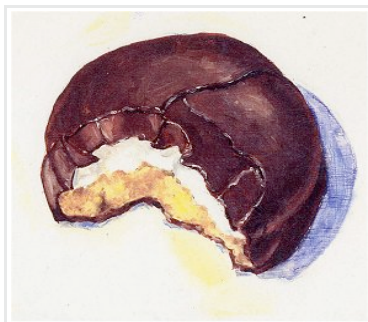
"Mallomar" by Bonnie Case, 2003 Oil on board